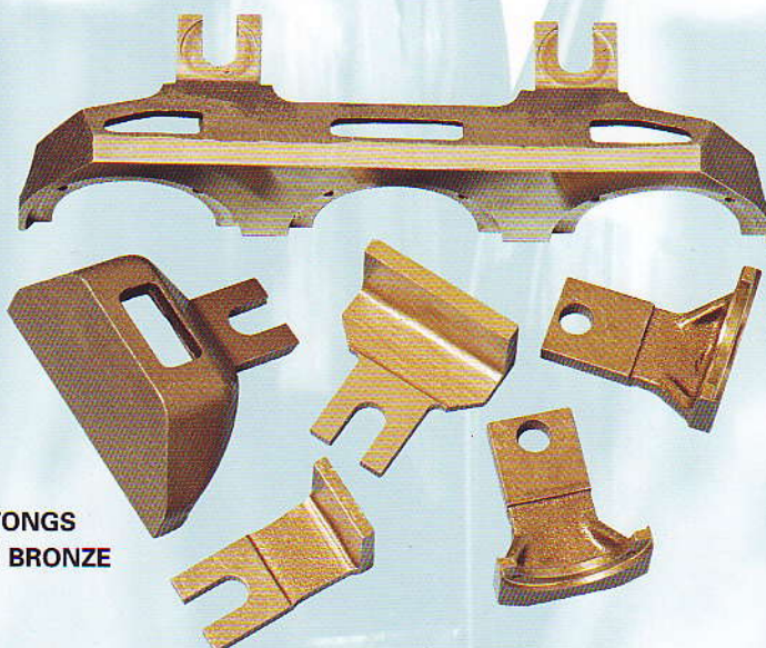
TAKE-OUT TONGS IN ALUMINIUM BRONZE