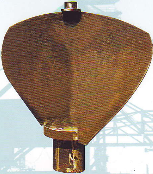
VARIABLE PITCH PROPELLER BLADES UP TO 1500 KG