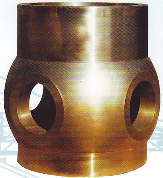
PROPELLER HUBS UP TO 2000 KG